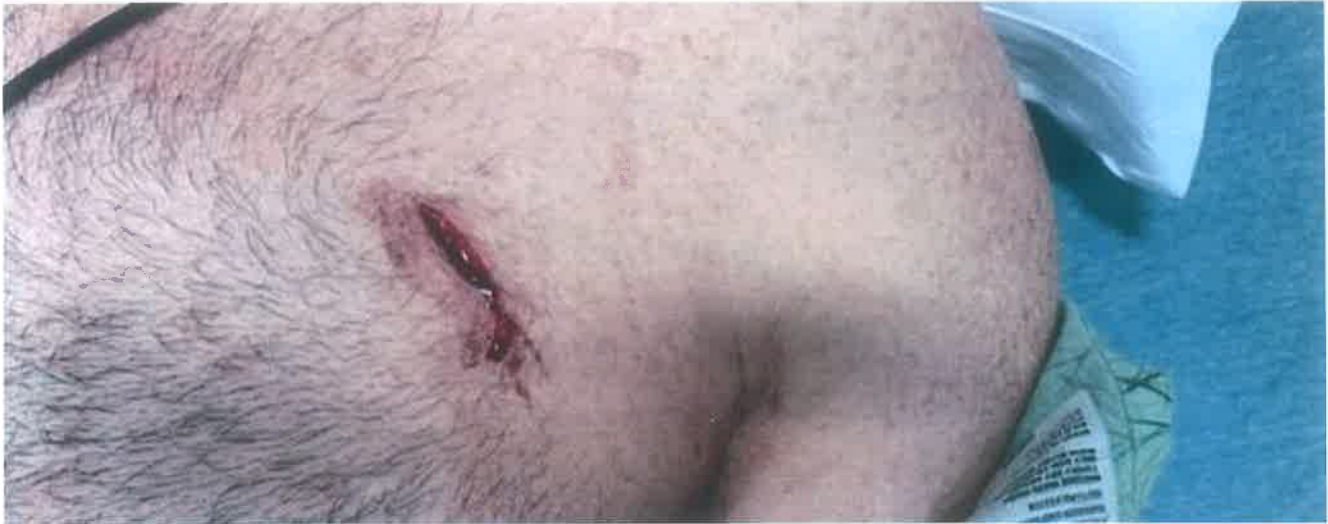
LE2 was medically treated for a stab wound to the chest inflicted by Li.